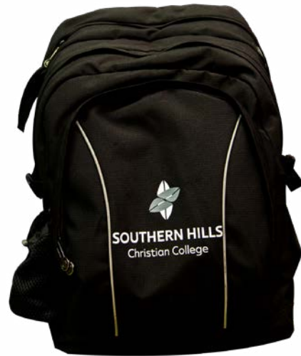
Middle / Senior School · 40L Backpack