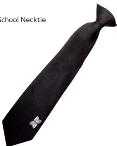
Black School Necktie