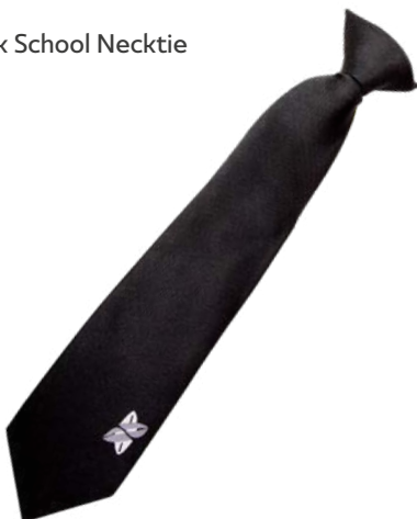
Black School Necktie