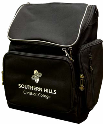
Junior Backpack · 23L Backpack

All bags must be labelled. It is compulsory for all students in Years 1-12 to use one of the following Southern Hills Christian College school bags: